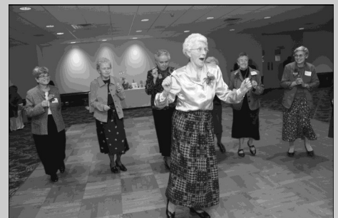
The Sisters of Charity were the first on the dance floor, and the last ones to sit down.